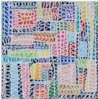
Pam Glick Bird Man, 2024 oil and acrylic on canvas 152 x 152 cm | 59 7/8 x 59 7/8 in

© Pam Glick, Courtesy MARUANI MERCIER, Belgium