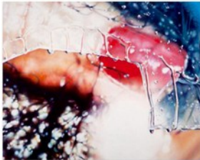
Marilyn Minter Cracked Up 2013 enamel on metal 24 x 30 in