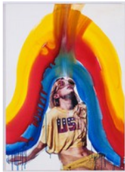
Liz Markus Wildfox USA 2016 acrylic and collage on canvas 60 x 43 in