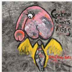
Judith Bernstein Cockman #3 2016 acrylic on canvas 72 x 72 in